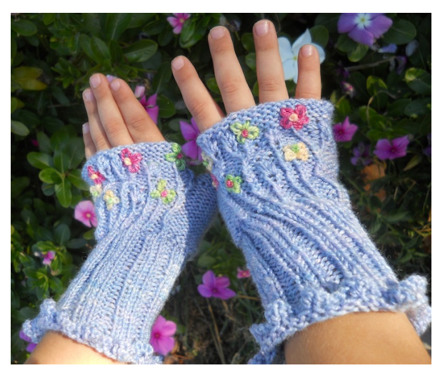
Gauge: 6.5 sts / 9.5 rows per inch

Notions: cable needle (if not cabling without a needle), 2 stitch markers, tapestry needle, waste yarn, crochet needle